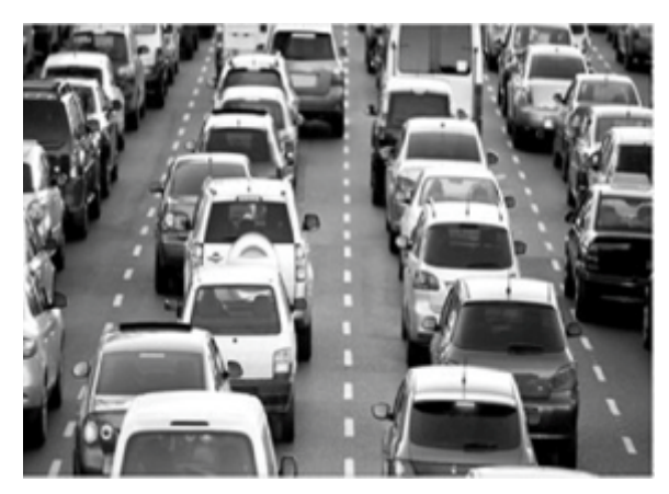
Figure 1 Complex scenario of traffic

By using these tools, learning can become interactive and more research can be done [6]. The cities that are proposed to develop as SC have vary in size, and for this reason we cannot have a standard approach to apply technologies. Another significant contribution was mentioned in [7] where the authors monitor traffic with a novel approach of collision detection and smart traffic management applications with a compact and strong infrastructure approach. In [7], it is suggested that initially, we should do a pilot study on smaller cities, which not only is cost-effective but also helps in calculating the outcomes fairly. The environment sustainability of a city is always an essential factor as it may help to figure out the available green spaces which reflect the quality of life of the citizens. Therefore, the implementation of SC idea in such cities will help to lower the marginal cost, if further improvements are provided [8].